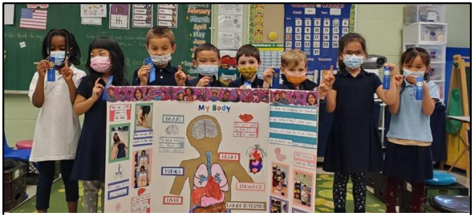
Kindergarten students earned first place ribbons for their Education Fair project about the human body.

Students in grades K-8 enjoyed their visit to Union Springs Academy for Education Fair. Many came home with colorful ribbons to celebrate their hard work on this year's projects.